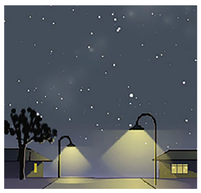
▲ Preventing upward light spill from fixtures keeps illumination low and helps prevent light pollution. ILLUSTRATION PROVIDED.

Eccles promised his council would consider a community request for a dark-skies policy in that municipality.