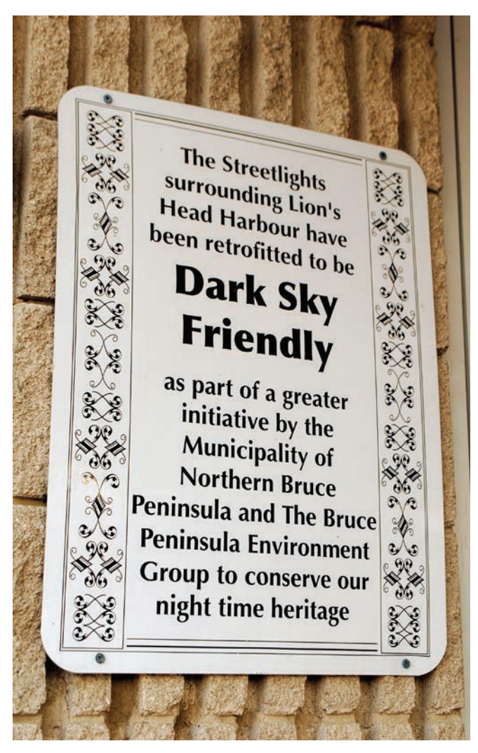
▲This sign hangs on Lion's Head Marina office.

More municipalities along the Niagara Escarpment are reviewing dark-sky issues for conservation and cost-saving reasons.